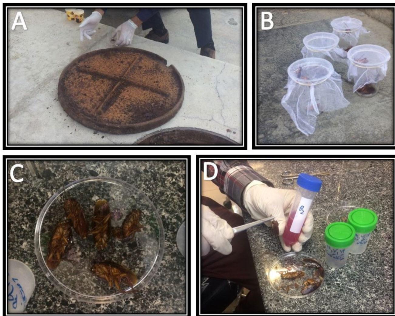
Fig. 2 The Sampling of cockroaches using the hand-catch technique (A). Transferring alive to the laboratory (B). Washing out the external body with PBS (C). Washing gastrointestinal tube with PBS (D)

Bioneer Company, Korea (AccuPower® CycleScript RT Premix with (dN6).